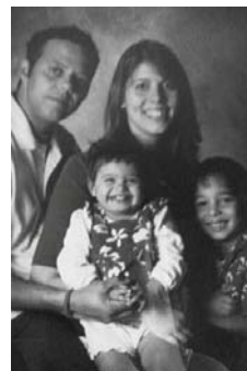
The Gevert Family

"We have so much to say but one thing that stands out in